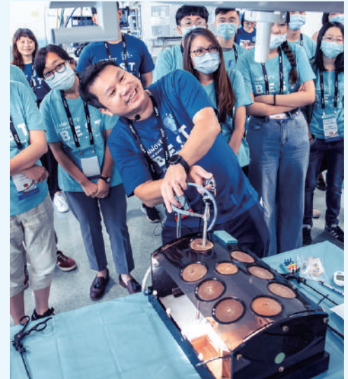
S.URGICAL T.ECHNOLOGIES 手術科技