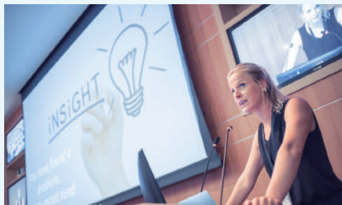
專題演講 KEYNOTE LECTURES