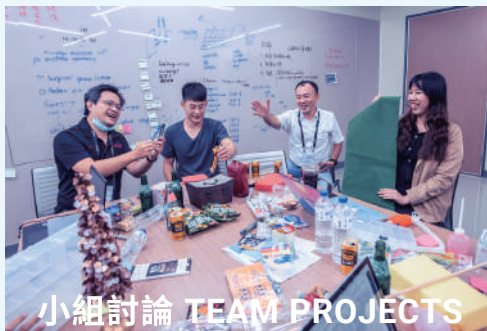
小組討論 TEAM PROJECTS