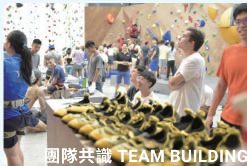
團隊共識 TEAM BUILDING