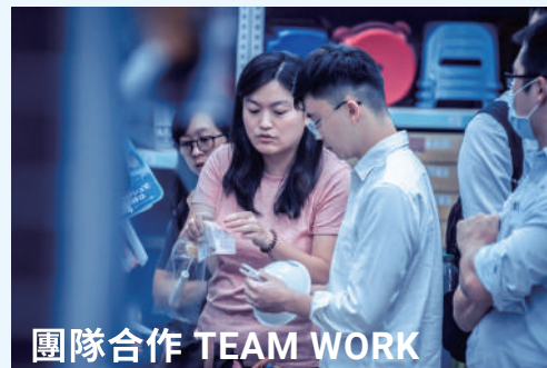
團隊合作 TEAM WORK