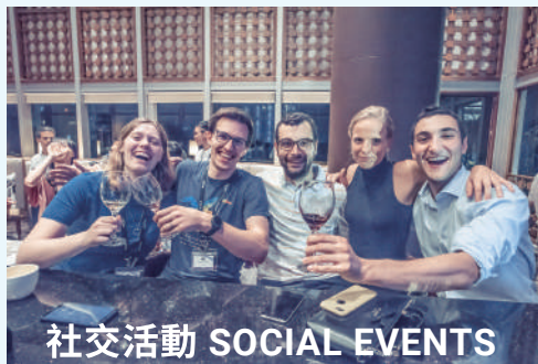
社交活動 SOCIAL EVENTS